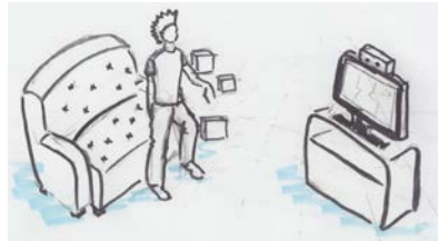
Figure 1: Overview of our concept. A user is able to control the smart home environment by placing parts of the user's body into trigger areas to trigger actions such as changing the TV channel.

Our system is able to turn any ordinary (physical) space into an interactive, “smart” environment: The main input is provided by a sensor that is able to track the three dimensional position and posture of the human body and limbs in the corresponding environment. Events such as switching on a lamp, controlling the hi-fi system, or starting a program on an embedded system can be activated when selected body parts hit pre-defined interactive spatial areas of the environment (cf. Figure 1). We therefore distinguish three different items that define the system behavior: triggers, actions, and mappings.