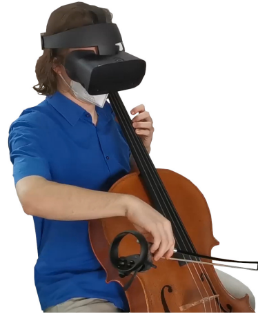
Figure 2: We currently track position and orientation of the bow through a VR controller fixed to it.

Work in the field of human-computer interaction addressed tasks such as assessing musicians’ playing and providing respective feedback. Augmented reality, for instance, has been used to display information on drum kits [26] and guitars [13]. Let’s frets! [14] uses LEDs and touch sensors on the fretboard to display and check exercises. Other approaches [10, 28] use sensor measurements in order to adapt the tempo or difficulty of exercises, or to allow users to