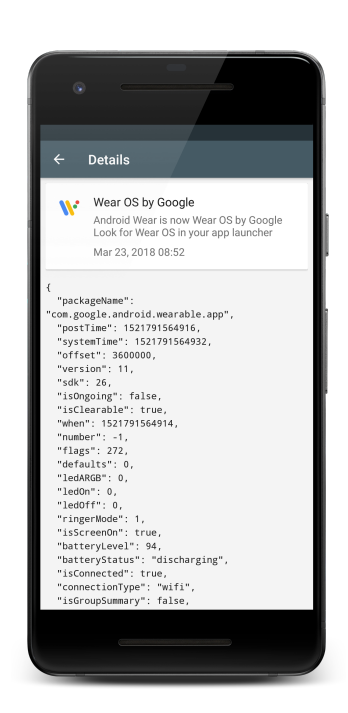
Figure 4: The details screen shows a preview of a logged notification and the corresponding JSON representation.