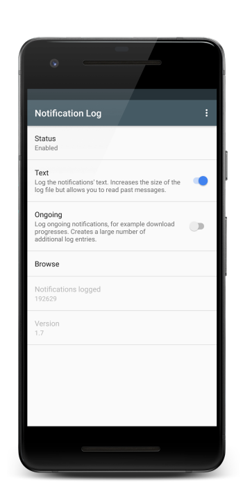
Figure 1: The settings screen allows users to control if and how notifications should be logged. The screen is extensible and allows for a simple integration of additional options.